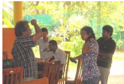
During the field visit

CHA made a field visit to Aralaganwila to oversee the Maduru Oya - EZy Water project which is implemented in East by Richfield Lanka (Pvt) Ltd., under the e-Society initiative funded by ICT Agency in Sri Lanka. Basis of the EZy Water Project is using Information and Communication Technology to pilot and introduce demand based water allocation and distribution procedures to manage water in the Left Bank of Maduru Oya so that available water resource is allocated fairly among communities to be settled in the Right Bank. As the consultant for Tamil language field support for eSociety projects implementing in north and east , representatives of CHA visited the project location on 21 st and 22 nd August. During the visit had discussions with the Team Leader, System Developer, Irrigation Engineers and Training Specialist and got to see the water distribution system via Distribution canals. The Canal Modeling Software that is in the development process also was demonstrated. As part of the visit attended the Training of farmers of the blocks Wijayabapura & Damminna which held at Aralaganwila Training Center by Richfield Lanka.