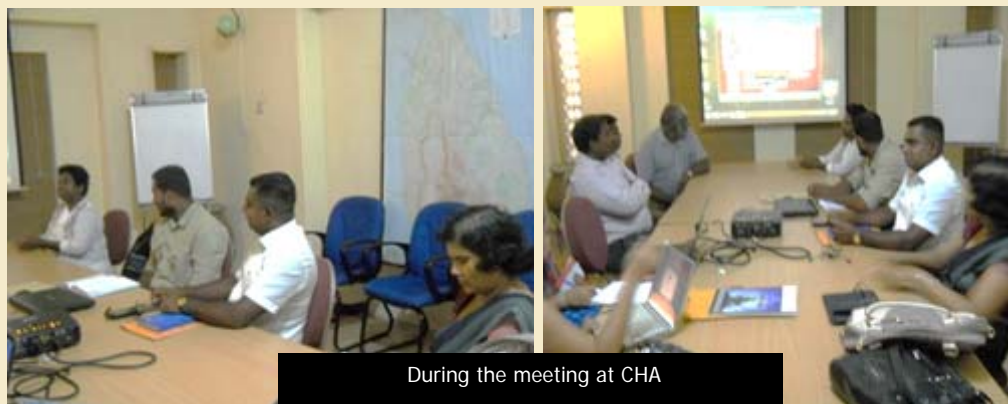
During the meeting at CHA

The working group also intends to come up with practical solutions to address service delivery gaps and focus on case conferencing mechanisms and addressing the needs of any case with acute psychosocial needs. The working group meeting with the District Coordinators was held on 12, August 2013 at the CHA auditorium. The working group was able to introduce the initiative in a more descriptive manner to the Coordinators and get their suggestions and viewpoints about it. Each of the coordinators presented the system followed in their respective districts. The Working group was able to get a good idea about the existing systems in the eastern, Northern provinces and Hambantota District. These Coordinators were more than willing to provide their support towards the initiative.