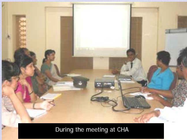
During the meeting at CHA

The 2 nd meeting was held at CHA. Standing committee members from ZOA, Sightsavers, CBM, and Department of Disability Studies of the Faculty of Medicine-Ragama, BCGR, and National Secretariat for persons with disability (NSPD) and individual advocates on disability were present. Ministry of Social services invites articles before 15th September 2013 for the souvenir on world disability day.