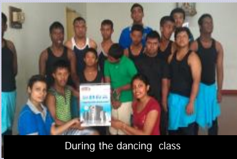
During the dancing class

Two of the Youth forum members visited the Special Children's Education Development Foundation in Narahenpita on 04, August 2013. The foundation