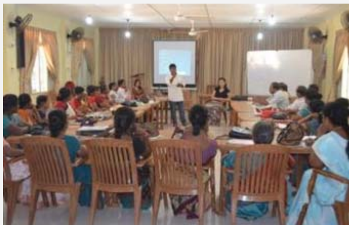
During the workshop at Jaffna