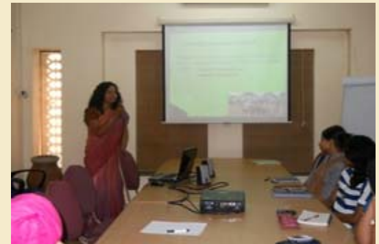
During the coaching workshop