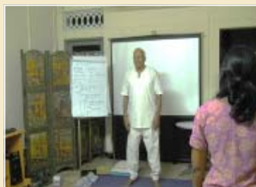
During the yoga session