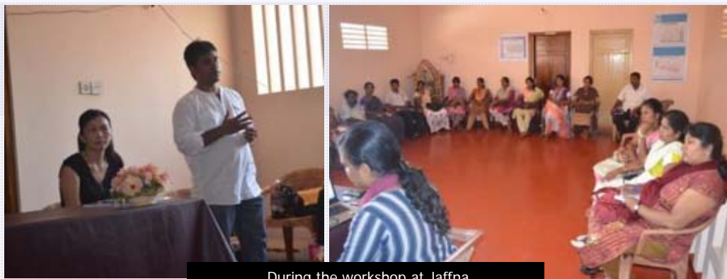
During the workshop at Jaffna