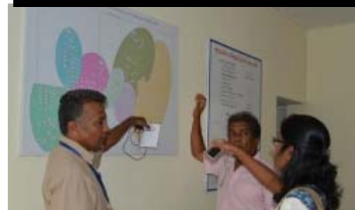
During the field discussions