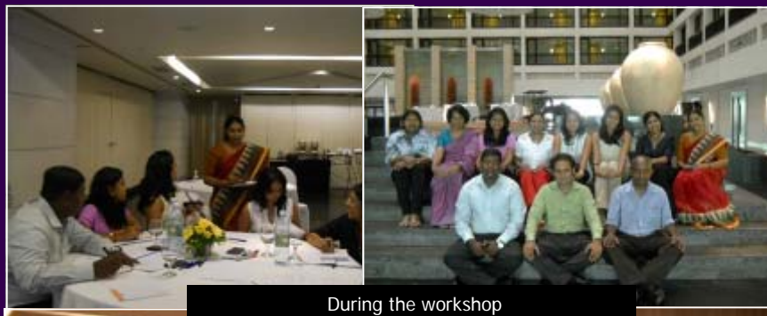
During the workshop