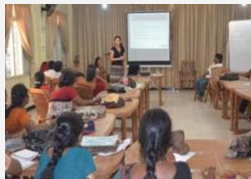
During the workshop at Jaffna