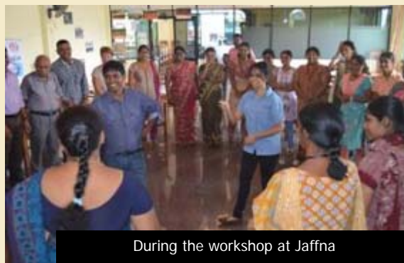
During the workshop at Jaffna

The district of Jaffna is a key location for facilitating and contributing the inputs and resources for the mental health sector in the Northern Province of Sri Lanka. There are trained human resources available in the district but which