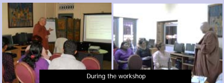
During the workshop

The alcohol and drug abuse workshop was held August 2, 2013 at the CHA auditorium from 9.30 Am to 12.30 Pm. The workshop was conducted by Rev. S. Upatissa, an expert counselor in alcohol and drug abuse.