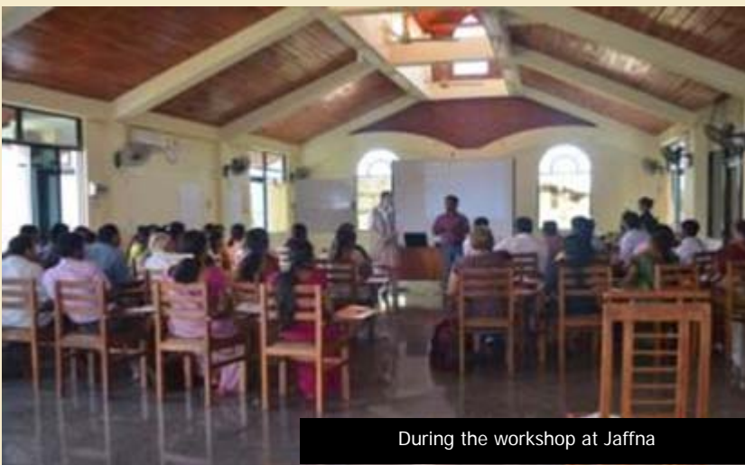
During the workshop at Jaffna

Interventions for psychosocial wellbeing and mental health in the war affected Northern Province is identified as a great needs. There are number of service providers both in Government and Non-government sector who have been providing their services for a long time in the location.