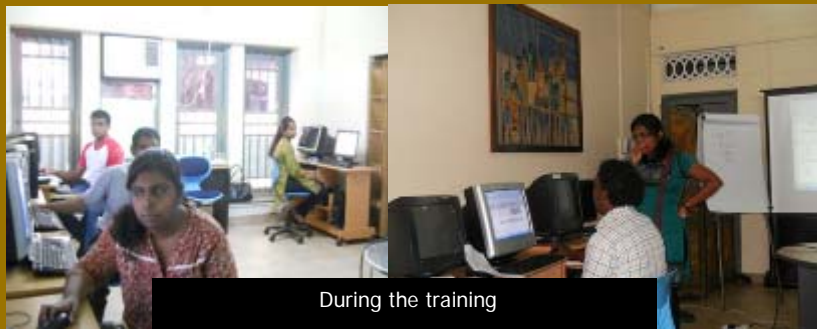
During the training

This workshop was held at CHA .Participants were from Hellmann Worldwide Logistics (Pvt) Ltd, VILUTHU Centre for Human Resource Development, Avery Dennison Lanka (Pvt) Ltd, Youth for Christ and CHA