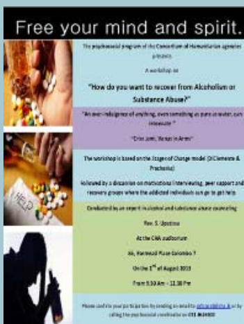
The above image was sent to all members notifying them about this workshop.