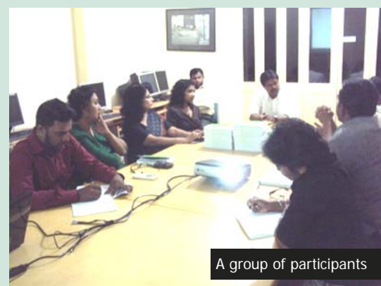
A group of participants