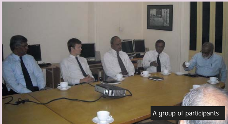
A group of participants