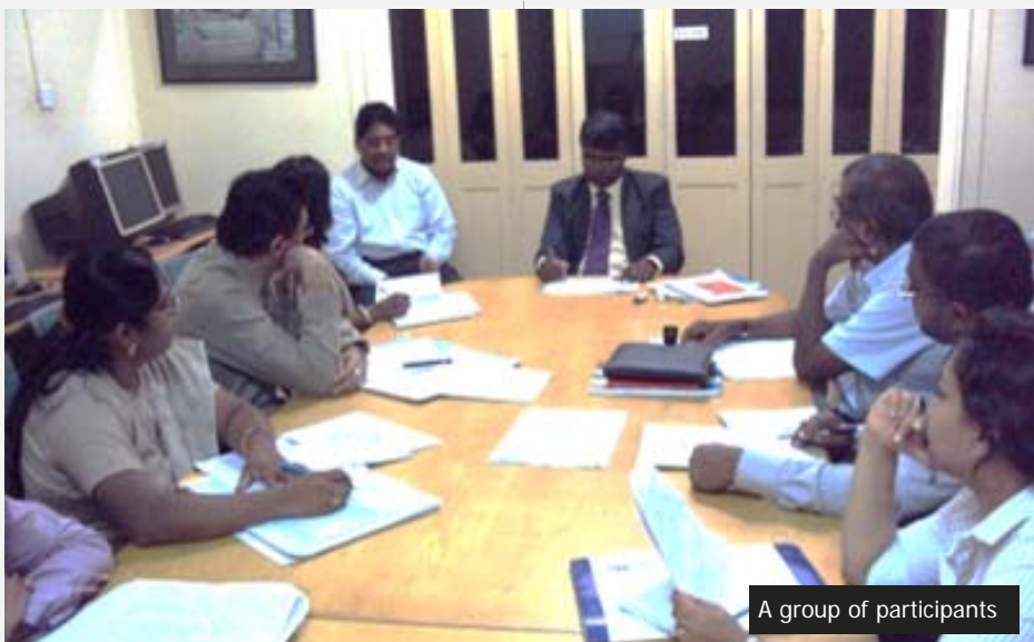
A group of participants

A consultative meeting on issues related to Women, Children, Prisoners, Law Delays, Torture and Migrant Workers was organized by The Consortium of Humanitarian Agencies (CHA), the Council for Liberal Democracy (CLD) and the office of the Advisor - Reconciliation to HE the President.