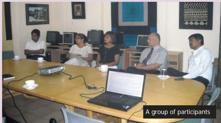
A group of participants

A small group of persons who met recently have decided to promote collectively empathizing with all victims of the conflict, whether civilian, soldier or combatant, belonging to Sinhala, Tamil, Muslim or other communities spread over the life of the 3 uprisings.