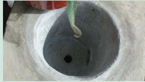
Well recharge system— construction completed Mrs. Messimallar's residence