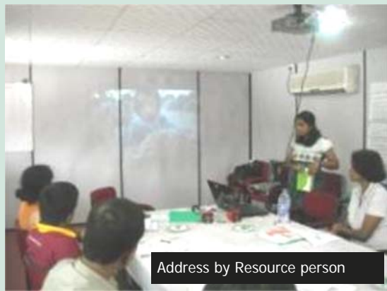
Address by Resource person

An introductory session on Sphere Handbook 2011 edition was conducted at Care International Office, Vavuniya. There were 15 participants, 8 from Care International and 7 from World Vision Lanka.