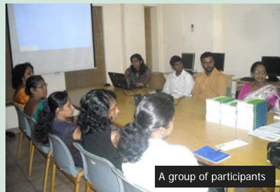
A group of participants

Introductory session and dissemination for Librarians was held on 31st May 2011 at CHA