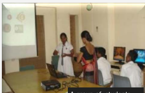
A group of students

Shown the CHA server room and machines, routers, data switches and data cables; explanation on how the network system works as it would help them to create presentations for the exhibition.