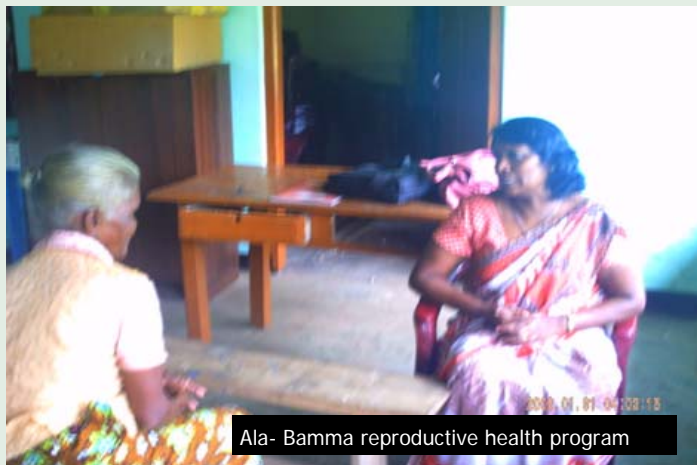
Ala- Bamma reproductive health program

Psychosocial Community projects initiated by CHA for the slum communities Ja-ela divisional secretariat division- (Kandawatta and Ala-Bamma)