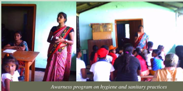
Awareness program on hygiene and sanitary practices

The CHA social work interns were able to organize shramadhana campaigns in both Kandewatta and Ala – Bamma areas. The intention behind these campaigns was to spread awareness about dengue and dengue prevention. The community members participated in these campaign