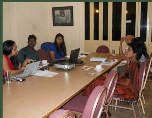
Working group meeting held on the 7 th of June 2013