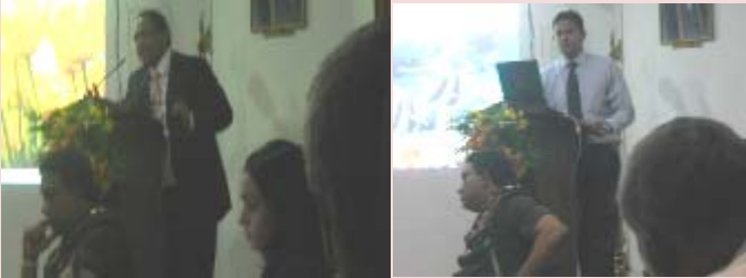
The Meeting on Rehabilitation of Addicted Substance Misusers in Sri Lanka was held on 15th March 2013 at the

Auditorium of the National Dangerous Drug Control Board Office, Rajagiriya.