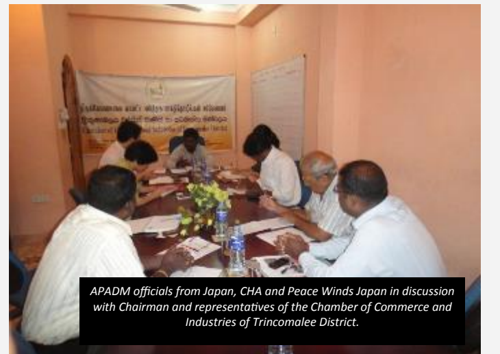
APADM officials from Japan, CHA and Peace Winds Japan in discussion with Chairman and representatives of the Chamber of Commerce and Industries of Trincomalee District.