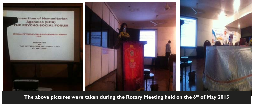
The above pictures were taken during the Rotary Meeting held on the 6 th of May 2015