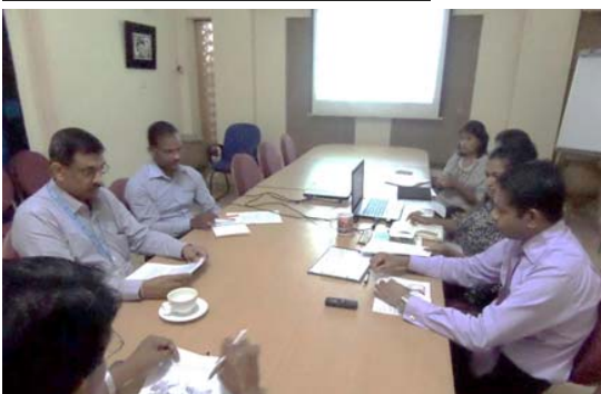
Network partnership meeting on Disaster Risk Reduction and Climate Change Adaptation