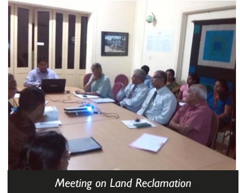
Meeting on Land Reclamation