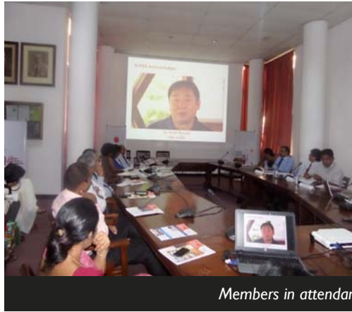
Members in attendance at the Network Meeting

the A-PAD SL to AP-AD Japan was appreciated by way of certification presentation. The meeting also gave light to other neglected urban problems. The A-PAD website was launched at the meeting. 28 persons representing the Government Organisations, Corporates, Donors agencies, Media, Bankers, INGO's and NGO's were present at the meeting.