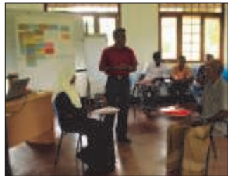
Two programmes conducted in Ampara