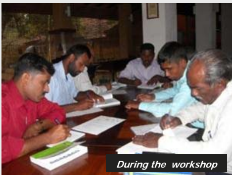
During the workshop

and the Disaster Management Centre (DMC) to strengthen the national and local disaster management capacities of Sri Lanka. 40 participants from Divisional Secretariat, District Secretariat, DMC, Irrigation department, department of Agrarian services, Ceylon Electricity Board, Sri Lanka Navy, Zonal education office, Forest department, National water supply and drainage board, Mannar-Urban council, Pradeshiya Sabha, Caritas, SLRC, Practical Action participated at this event.