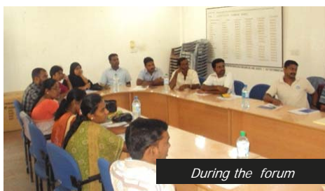
During the forum