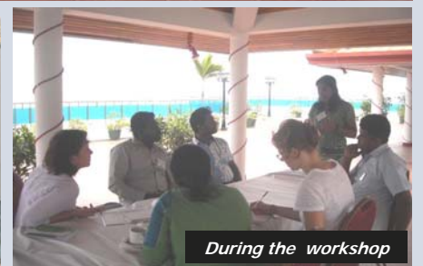
During the workshop