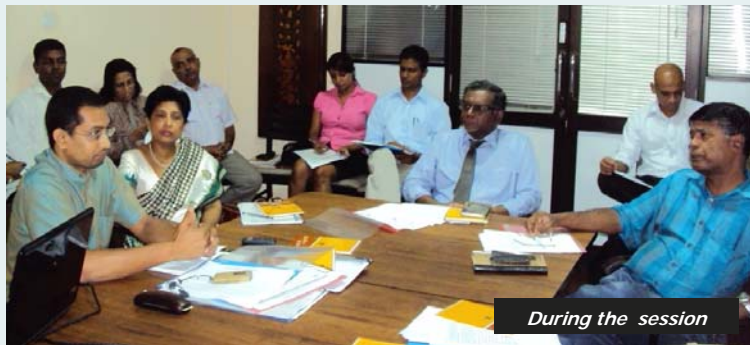
During the session