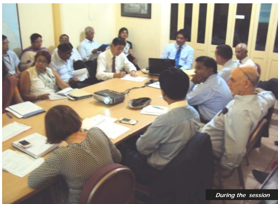
During the session