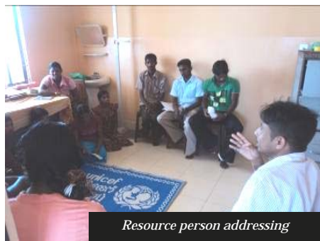
Resource person addressing

MM is now supporting services for people who suffer from psychosocial trauma in Vadamarachchi East area. The inau-