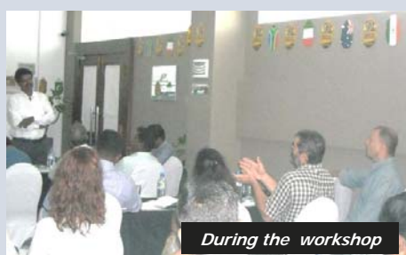
During the workshop