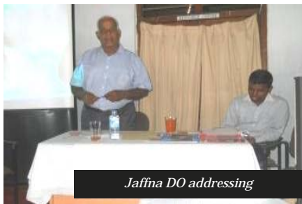
Jaffna DO addressing