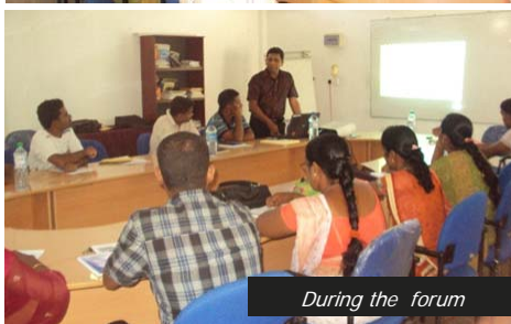
During the forum