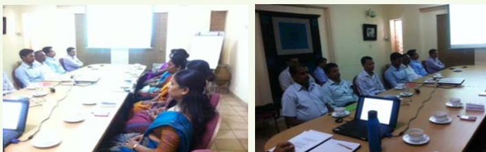
The above pictures were taken during the MoSS workshop